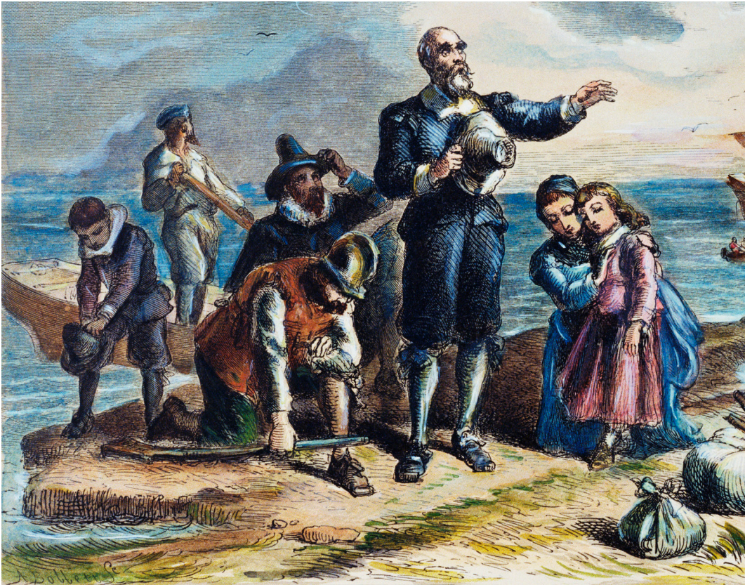
Pilgrims from The Mayflower arriving at Plymouth Rock

At first, the Native Americans were happy to help the settlers. They taught them how to grow native plants for food and medicine, where to find wild animals for meat, and how to use animal fur for clothes. But the relationship between the Native Americans and settlers changed when more and more settlers arrived and took more land. There were terrible wars between the Native Americans and the settlers.