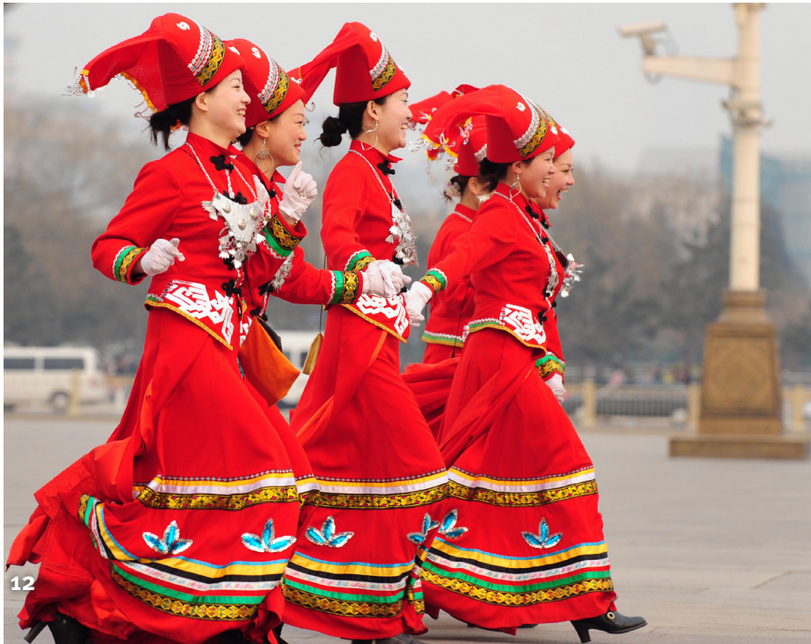
Brocade on Zhuang clothes

The Uyghur (about eight million people) is another large ethnic minority group. They live in the Xinjiang Uyghur Autonomous Region in the north-west of the country. Their language is like Turkish and most of them are Muslim (of Islamic religion). They, too, love music and play many different kinds of instruments. They are famous for the muqam , a show with traditional folk songs, dances and poetry that everybody in the village joins in with during local festivals.